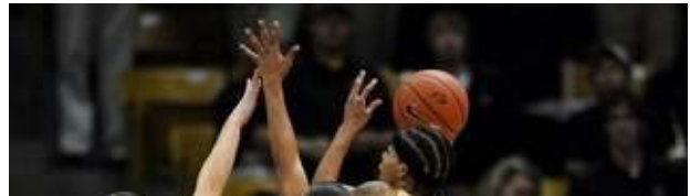
CU 73, CSU 49

"It was really frustrating because it is a rivalry, and we beat basically the same team last year and now we lose by 30. It is not a good feeling."